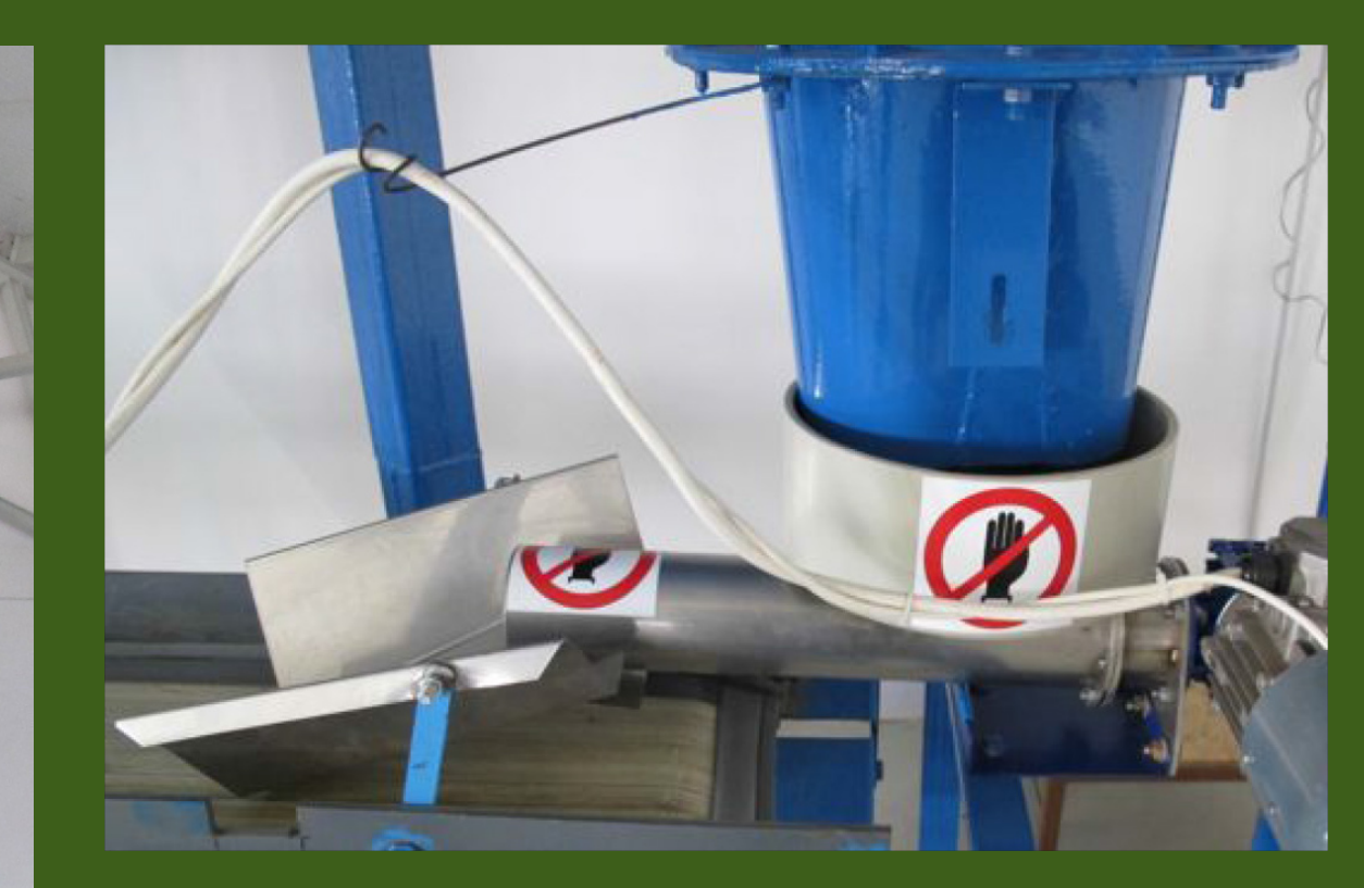
Blending Line Enclosed Vibrators